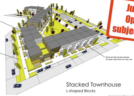
Stacked Townhouse L-shaped Blocks